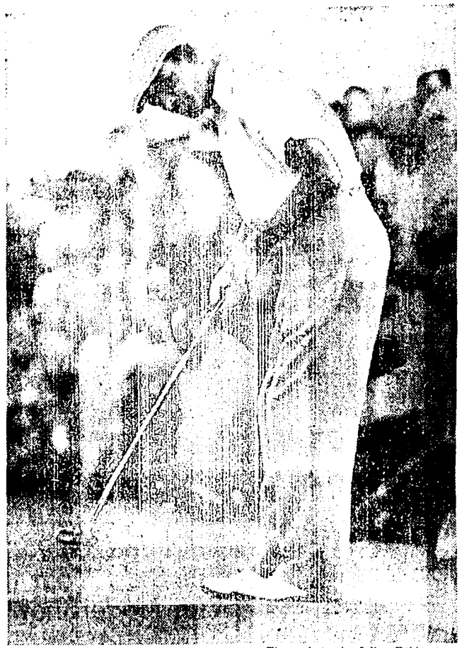
THE WINNING PUTT—Hogan watches ball roll into cup on 17th green for birdie. Subpar shot was the decider.